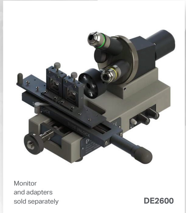
Monitor and adapters sold separately